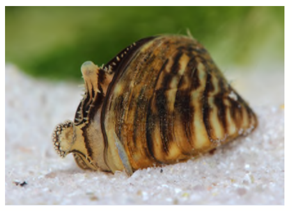
Zebra mussels are a small, striped freshwater mussel that can block water intakes and other infrastructure.