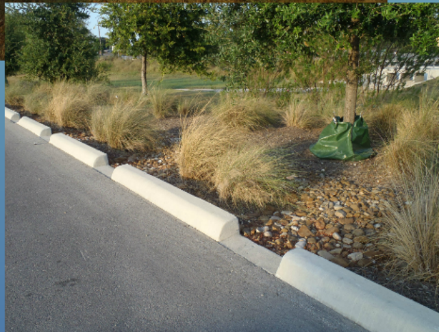
Upper San Antonio River