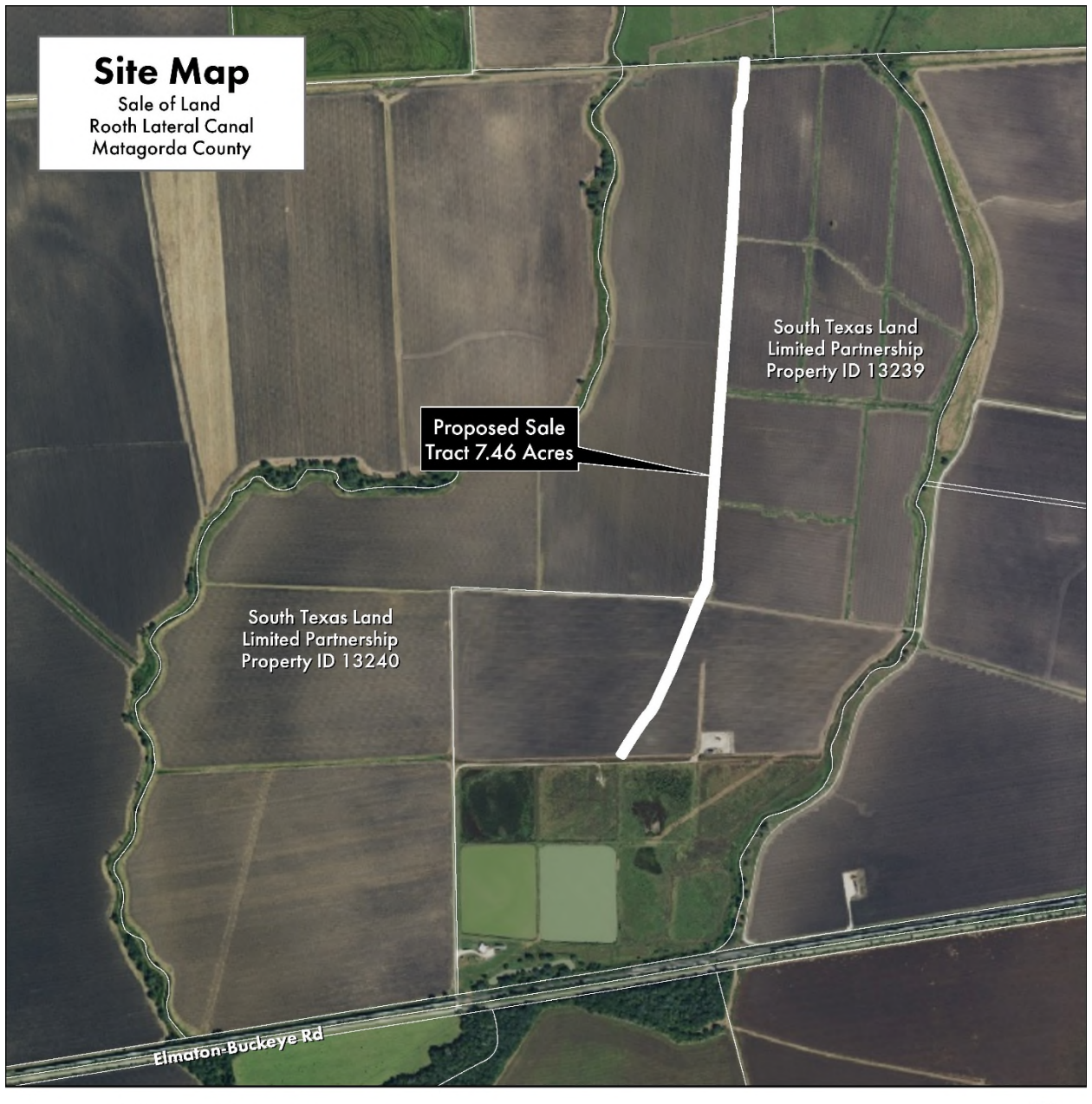
0 1,000 2,000 Feet